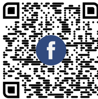
St John's Facebook page