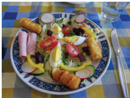
Egg salad made with free-range eggs donated by jobseeker Martin

Giraffe is Perth and Kinross's first not-for-profit community interest company dedicated to offering employment activities to local people with mental ill-health, disabilities and other disadvantages in the workplace. They are based at 51-53 South Street, Perth. For more details see their website: http://checkin-giraffe.uk/