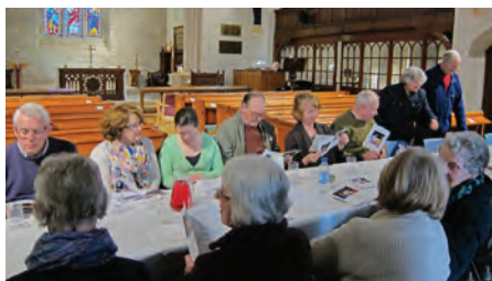
Seder meal on Maundy Thursday

A Soup and Bread Lunch was held for the start of Lent. Tea and biscuits were served after the Lent Talks. At Easter a Passover Meal was organised on Maundy Thursday and on Easter Day breakfast was served between the 0830 and 1030 Services. After the 1030 Service the annual Egg Hunt took place. In May we had an enjoyable and financially successful Silent Auction. The Patronal Festival Bring and Share Lunch was organised. A Garden Party was held at the Rectory which proved very popular.