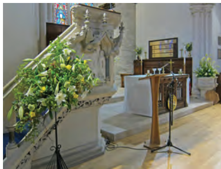
Flowers for the Patronal festival