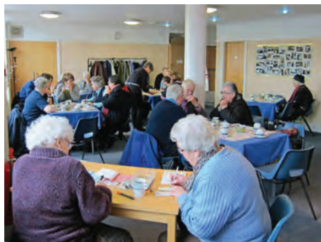
Fellowship coffee morning

The programme has been kept simple as it has been felt that for many those attending the chance just to meet up with friends and chat is important but we did have one outside speaker from the Archie Foundation. Members were very impressed at the simple things that could reduce the stress and trauma felt by the child and family when a child has to spend time in hospital.