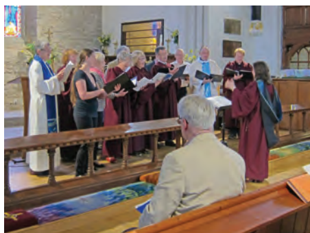
Workshop and anthem singing at the Patronal Festival