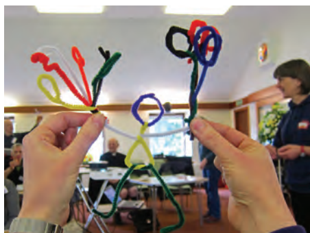
A pipe-cleaner modelling activity at the Diocesan 'Being Church with Children' event