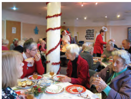
Fellowship Christmas party