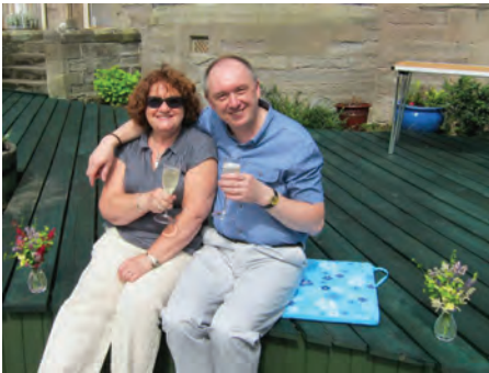
The timber decking was repainted before the Garden Party

As with the other buildings there is a maintenance programme in place to keep unexpected repair costs to a minimum. The garage door has recently been replaced, the timber decking was repainted before the Garden Party, and a new garden fence was erected earlier in the year. The garden is maintained by Graham Kingsley Rowe at a high standard. Funds permitting the external timbers are planned to be painted next summer. Given the height and complexity of the roof this will not