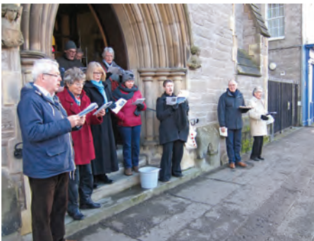
Christmas carol singing on the street