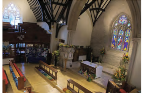
The inside of the church on Doors Open Day

This room and kitchen are too often the only area of St John's which visitors experience. It is a practical and versatile space but with a history as a pub