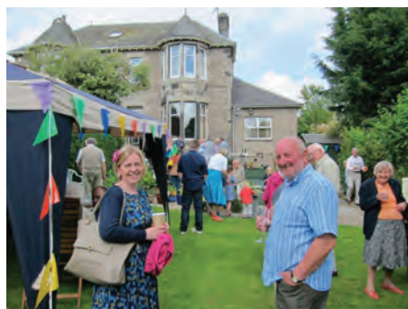
Parish picnic at Comrie

At the time of writing the catering for a Jazz Concert and Quiz night are being organised.