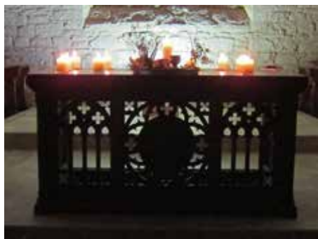
The candle-lit altar during the Maundy Thursday vigil