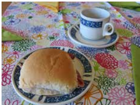
Bacon rolls and coffee for Easter morning breakfast!