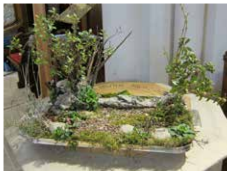
The garden of repose that would be placed on the altar for the vigil after the Seder meal on Maundy Thursday