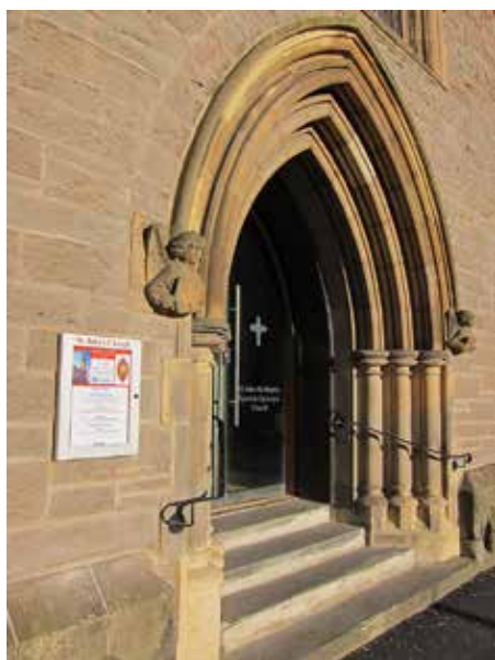
The new noticeboard by the main entrance

It was decided that a Fabric Fund should be set up to allow us to build up funds to support the building.