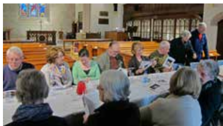
Sitting at table before the start of the Seder meal on Maundy Thursday