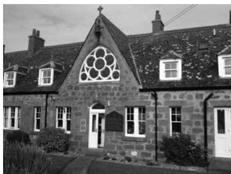
Bishop's House, Iona.