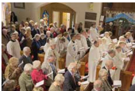
The introit procession