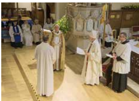
The Dean reads the licence